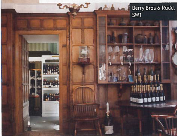
Berry Bros & Rudd, SW1