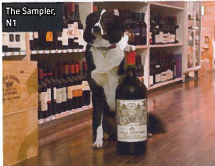
The Sampler, N1

A fantastic local wine merchant in the heart of South Kensington supplying some of the great surrounding restaurants with the best wines from Burgundy and beyond.